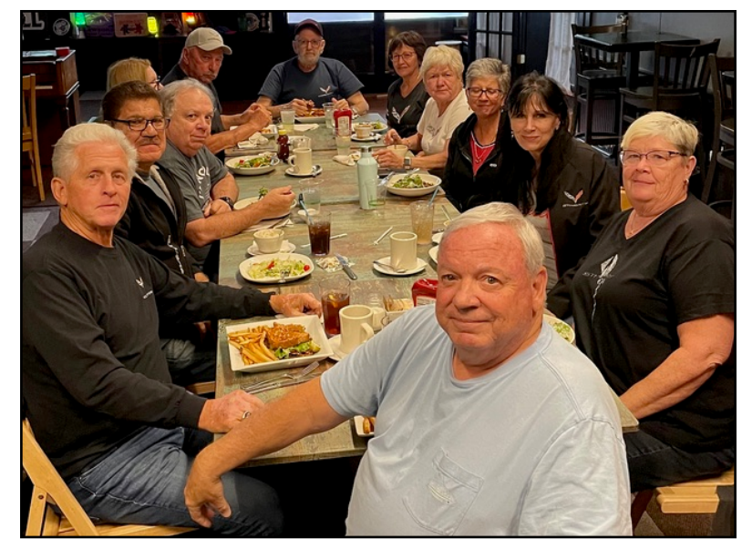
Lunch at the New American Grill